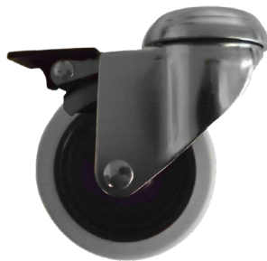
D) -EIS-00024 3" LOCKING CASTER