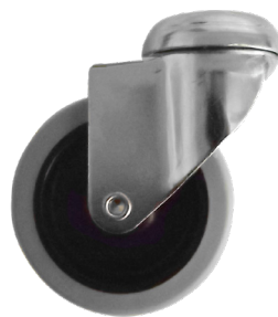
E) -EIS-00025 3" NON-LOCKING CASTER